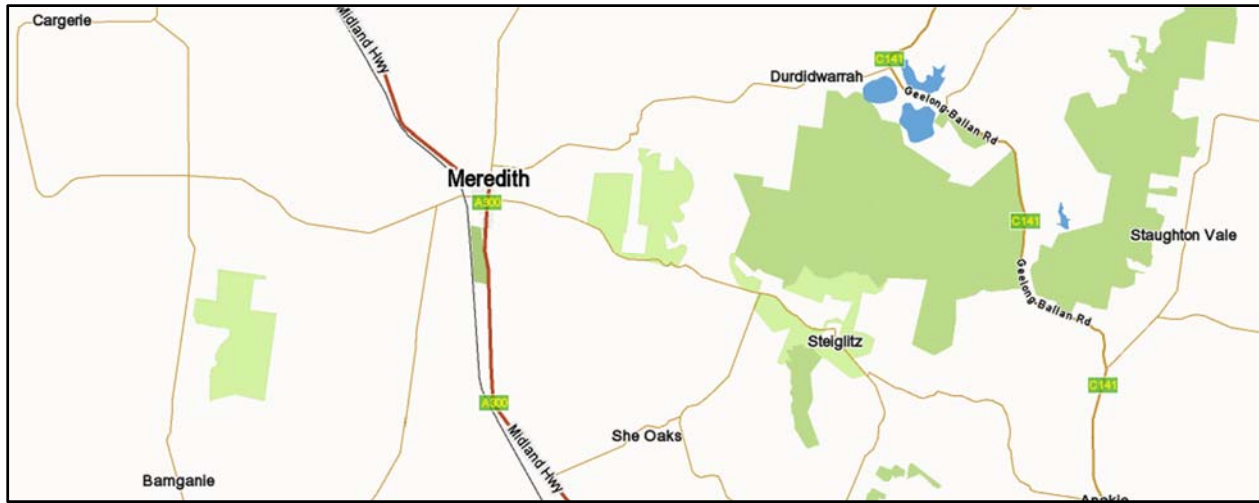
Figure 2. Cargerie, Bamganie, Meredith, She Oaks and Staughton Vale are north of Bannockburn.